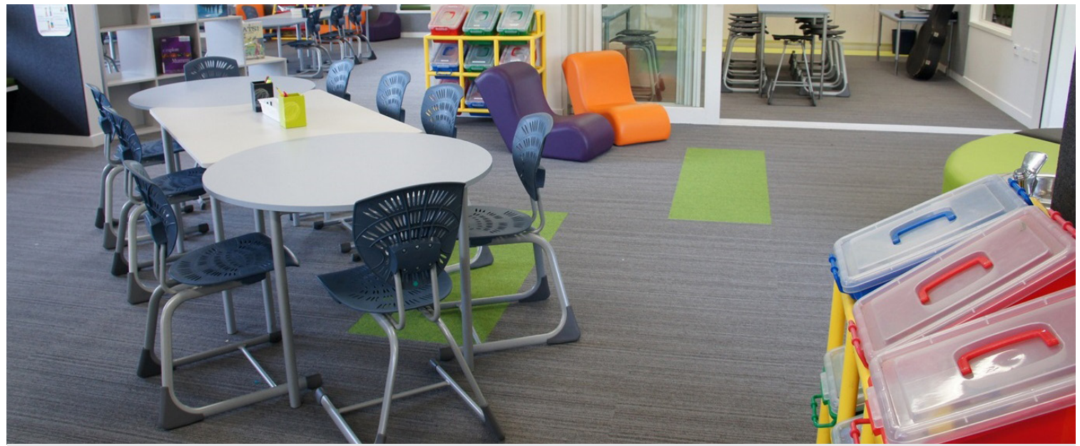
Open spaces with flexible seating arrangements.