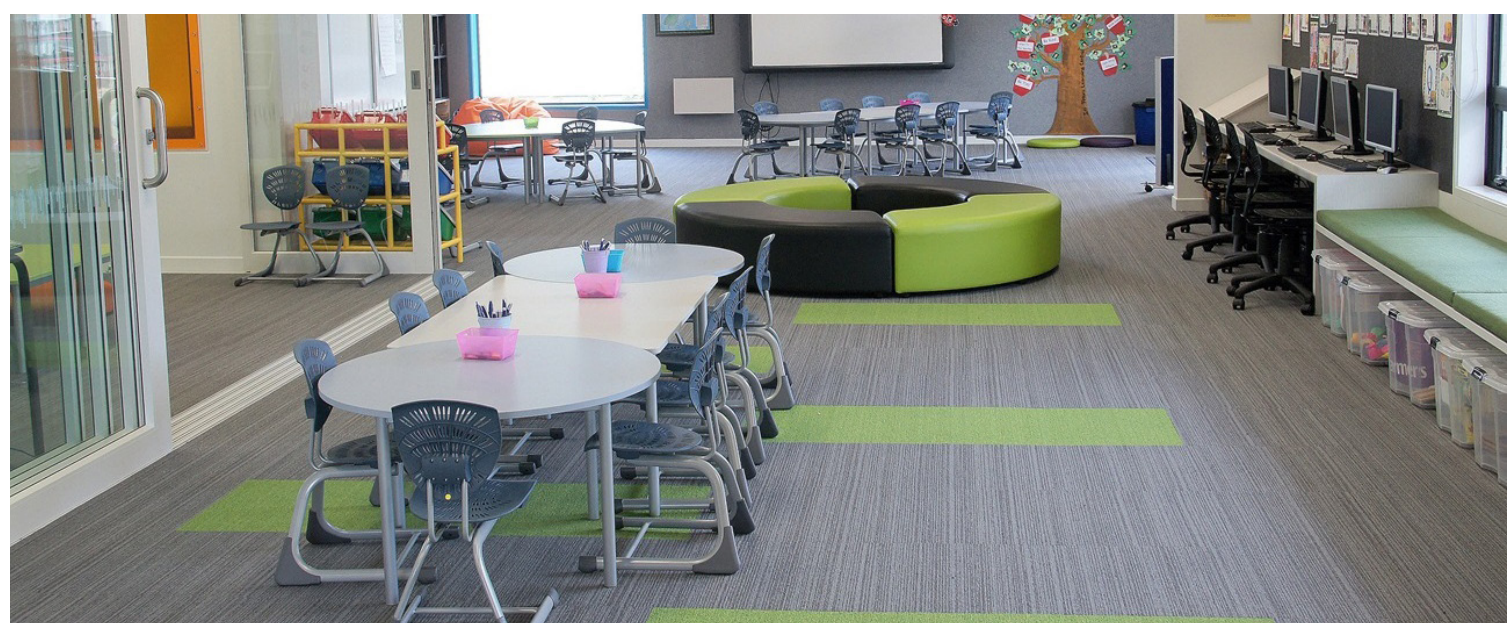
Furniture colour choices work in harmony with the building itself.