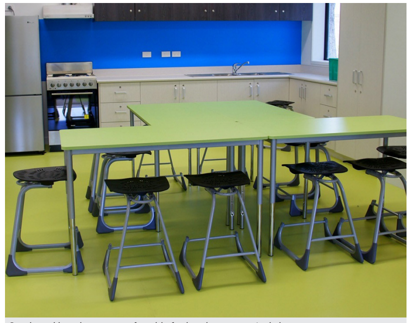
Stools and benches are comfortable for hands-on, practical classes.