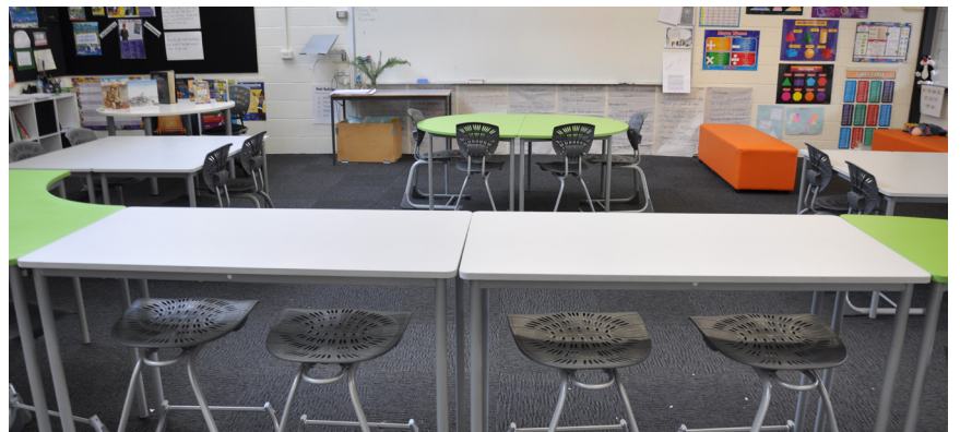
Flexible furniture gives options for traditional front of class teaching too.