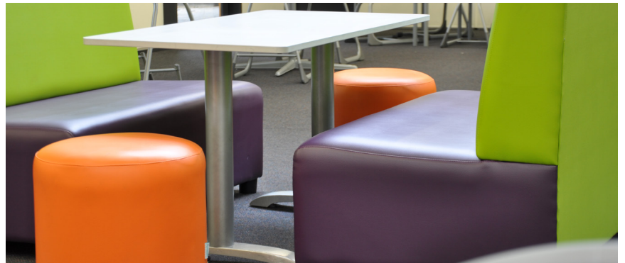
Informal seating areas are popular with students, teachers and parents.