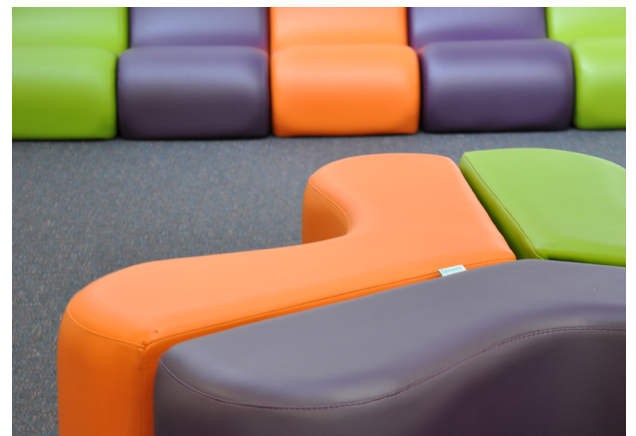
Akiako Splats can be configured in a number of ways.