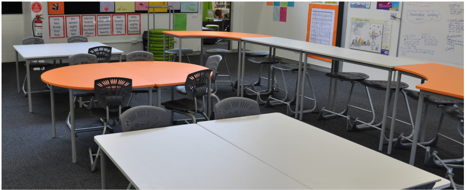
A range of tables paired with Bodyfurn® seating options can be found in many of the learning spaces.