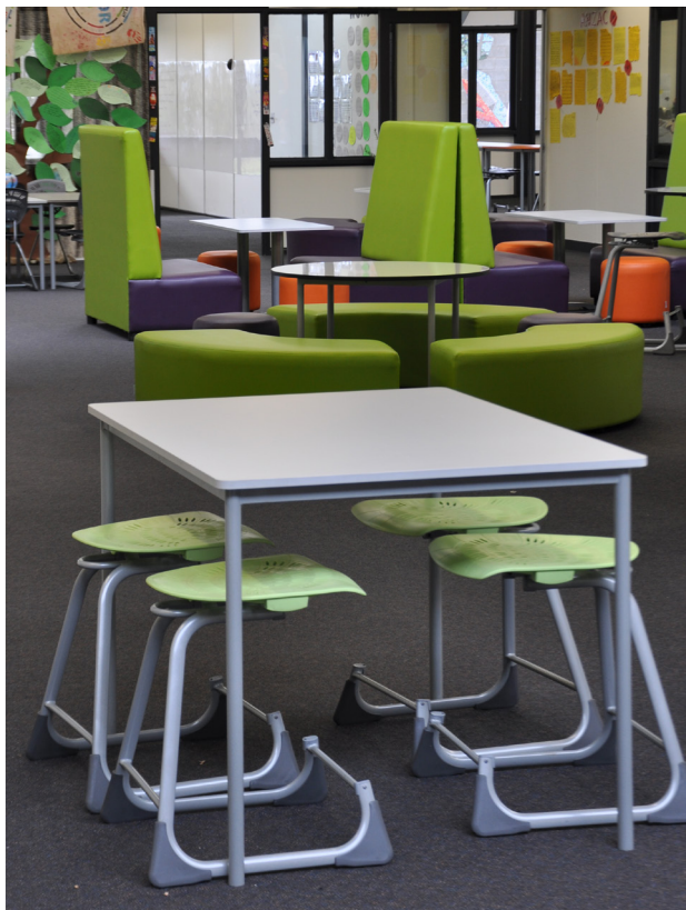
Whiteboard surfaces are popular for collaboration.