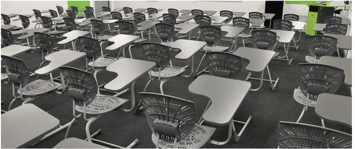
The Bodyfurn® Tablet Arm creates a stable, usable surface for note taking, laptop use and exams.