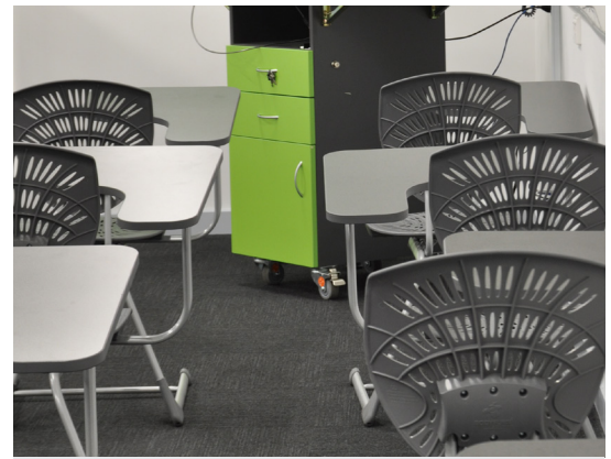
Pops of bright colour are great with the grey Bodyfurn® Sled Chairs.