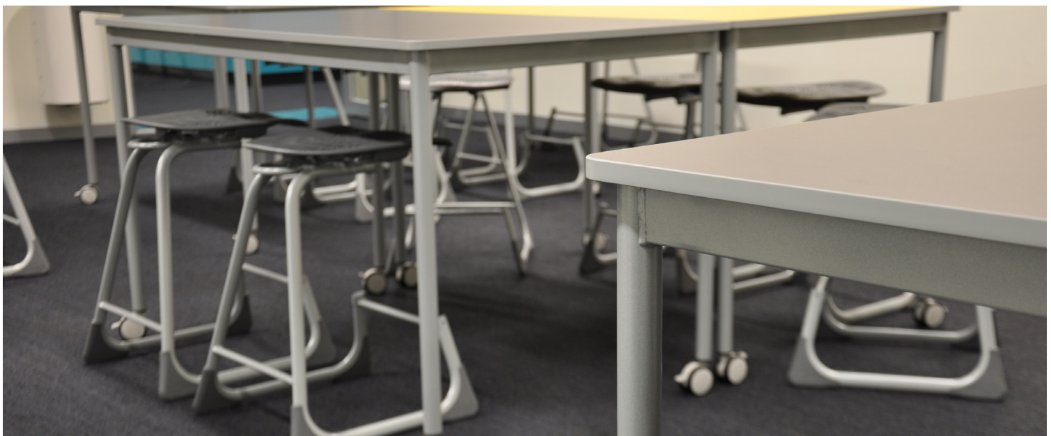
Bodyfurn® Lab Stools and high Rectangle Tables create a flexible lab space.